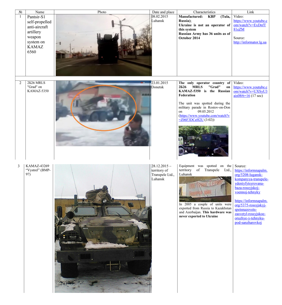
Facts of Russian military equipment and weapons presence on the territory of Ukraine

PHOTOS OF RUSSIA'S INVASION SUBMITTED BY SENATOR RON JOHNSON